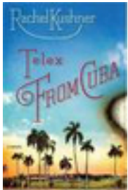
Rachel Kushner Author of Telex from Cuba