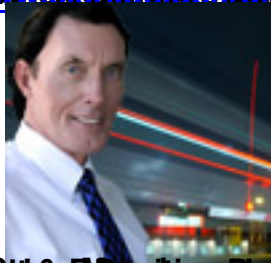
Host of Fictional Crimes podcast