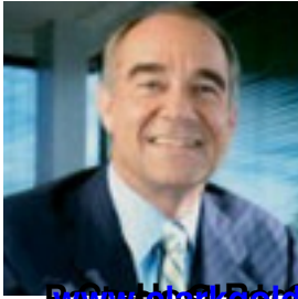
David Baldacci on Clark & Madrug