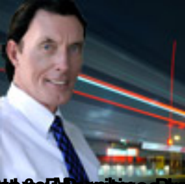
Host of Raplives Insider